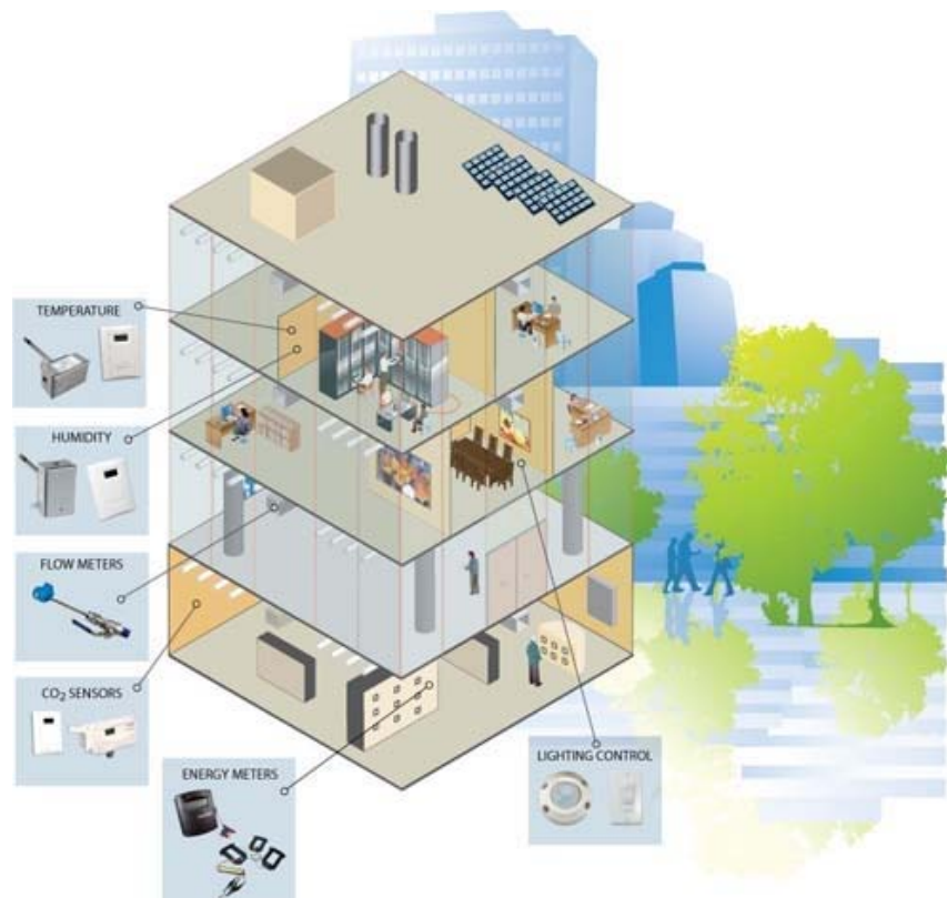
Figure 2: Intelligent Building design, with sensors incorporated throughout.

Temperature, humidity and CO 2 level are the three most important criteria for measuring interior comfort. Inefficient operation of a BAS system with regard to comfort levels consumes excess energy, which raises the building's utility bill and enlarges the carbon footprint. In recent years, BAS designers have been integrating the monitoring systems for all environmental comfort criteria into a single network. All data is sent to a central control system, which then makes decisions about how to balance the building's comfort needs with energy-efficient practices. Buildings that use this integrated, whole-building approach to monitoring are known as "intelligent buildings."