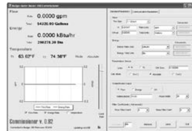
Figure 2: Main setup screen

Figure 3 shows the communication parameters tab. The user can select BACnet or Modbus along with the network address. If using BACnet, the Device Name, Device ID BACnet BitRate and the Max Master number should be entered for the appropriate network for which the 380 is being connected.