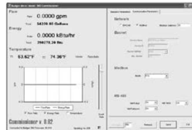
Figure 3: Communication parameters